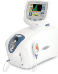
TRITON® DTS Traction System