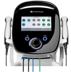
INTELLECT® Electrotherapy & Ultrasound