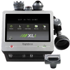
LIGHTFORCE® High-Intensity Laser Therapy