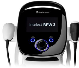
INTELLECT® Family of Shockwave